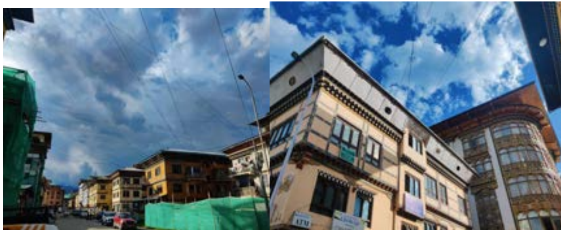
Figure 12: Multiple hanging communications cable of BTL in Paro town