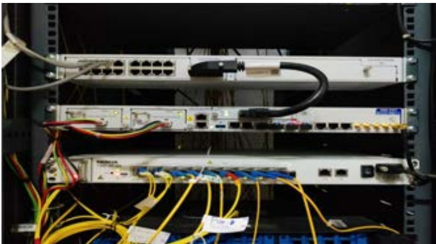
Figure 16 : FTTH(GPON- Nokia) installed at Wangdue BTL Office

Only BTL has FTTH network implemented in Bajo town, TICL does not have FTTH network at Bajo town and they use radio networks for internet leased line services. There is one FTTH(GPON) equipment at Wangdue BTL office of Nokia brand having 8 ports . Out of 8 ports, 7 ports have been utilized as shown in the figure below. Each port has the capacity to distribute 64 fiber to Home customers. The FTTH network of BTL in Wangdue is used in distribution of internet leased lines to its customers.