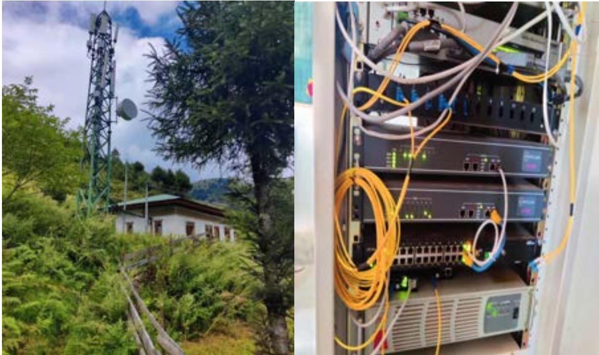
Figure 4: FTTC equipment of BTL at Damthang BTS