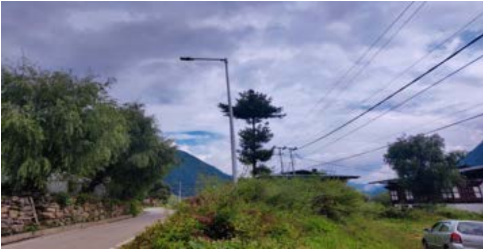
Figure 7 : Hanging cables over other cables of Leki cable service at Haa town