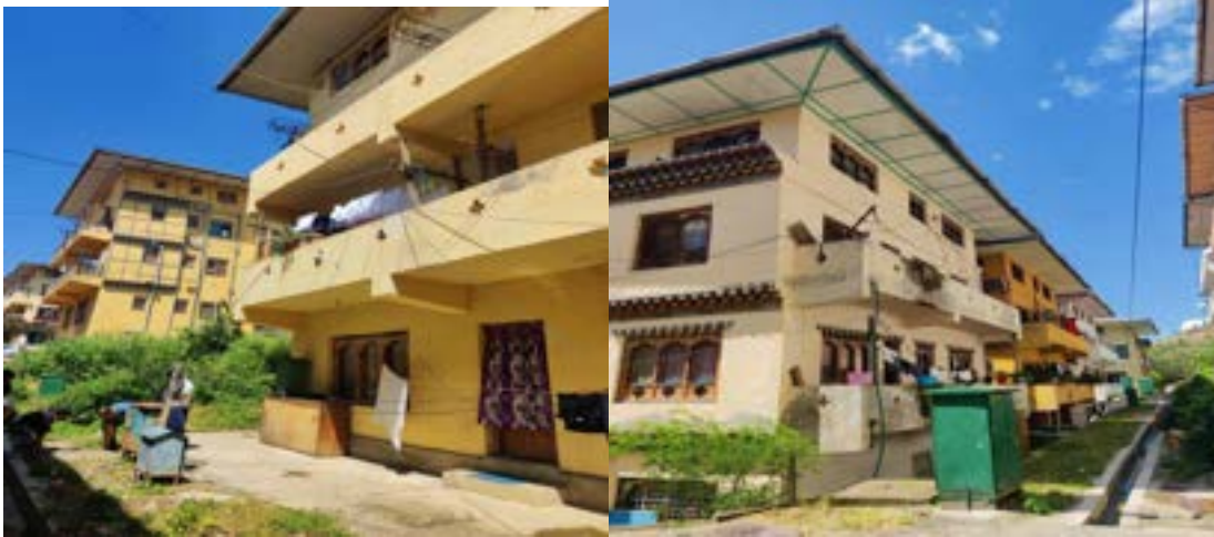
Figure 19: Hanging cables around the building at Bajo Town