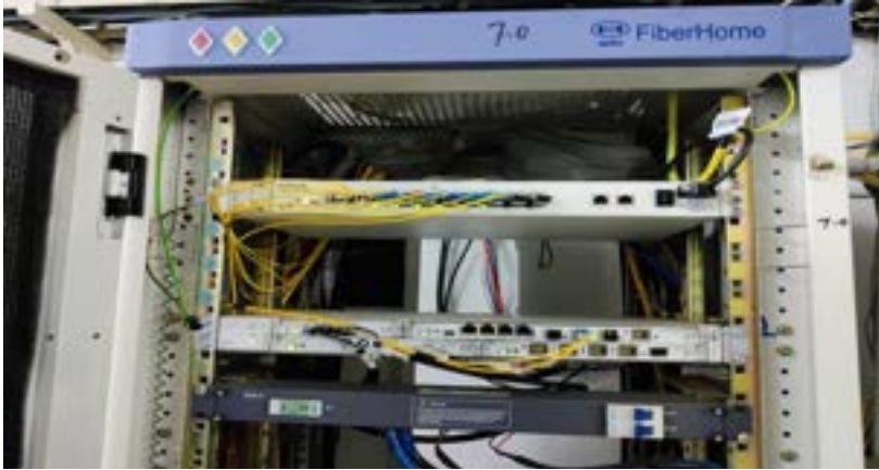
Figure 1: Nokia GPON equipment installed at Haa BTL office as part of FTTH part network

The FTTH network splitters are used for splitting and distribution of fiber network at customer end as shown in figure below;