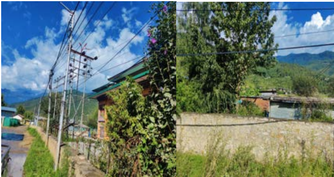
Figure 14 : Low hanging stray cables of TD Metho(left) and Sigma cable service(right) on the roads towards Dhopsahri Gewog center.