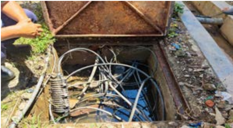
Figure 17: Underground duct system for communication services at Bajo Town