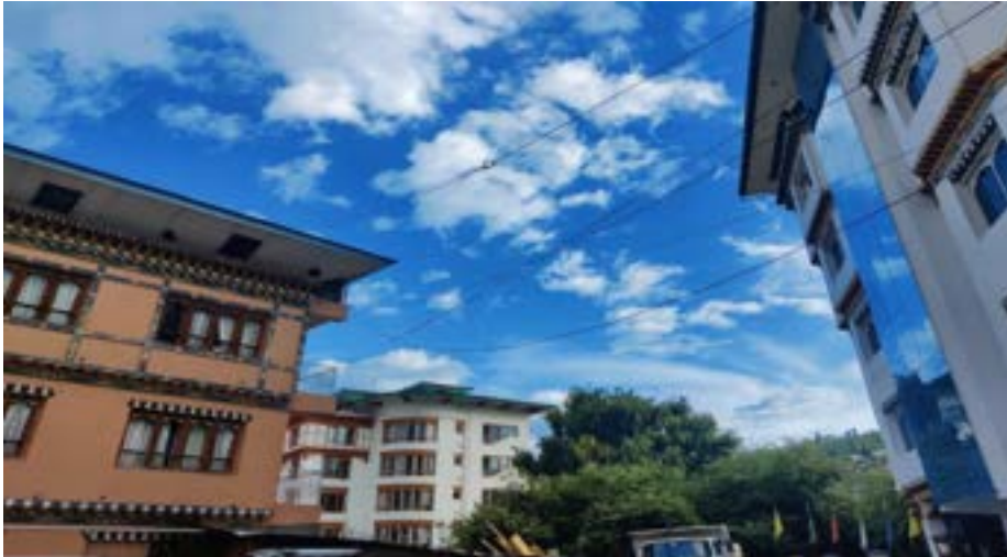
Figure 13 : Multiple hanging cables of TD metho cable at Paro town