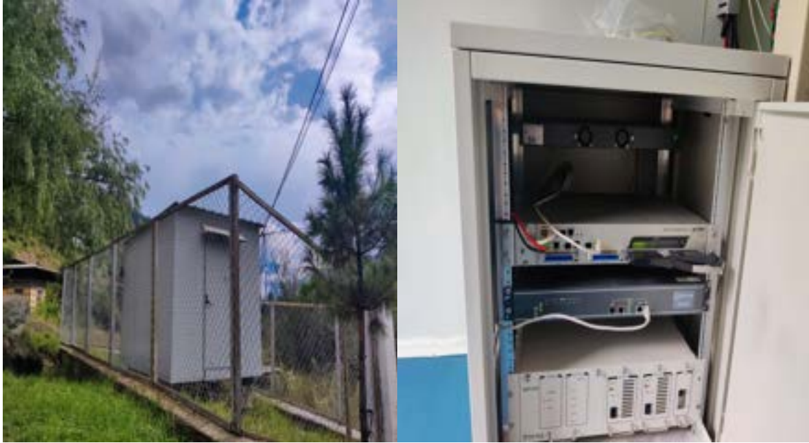
Figure 5: FTTC equipment of BTL at Gjenkana