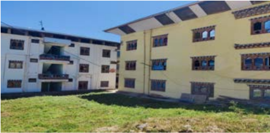
Figure 23: Low hanging cable of Budha cable in Khuruthang town