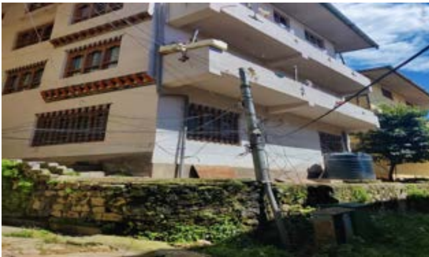
Figure 18: Hanging cables around the pole sharing sites.