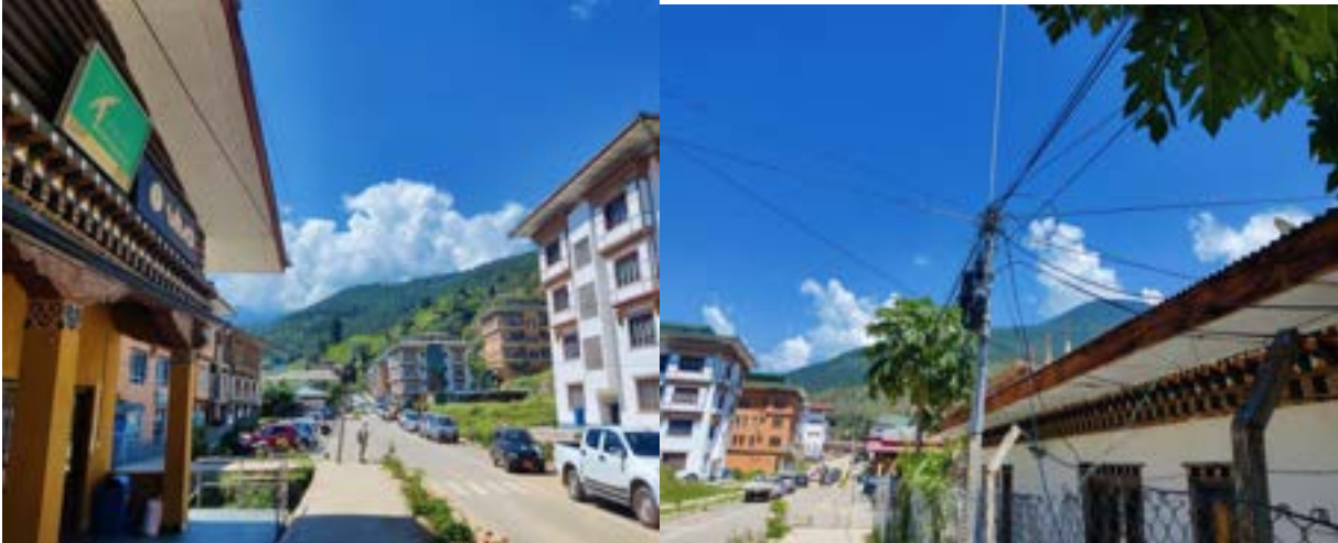
Figure 22: Low cable road cross over in Khuruthang Town