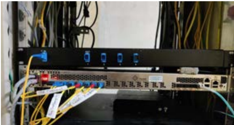
Figure 20 : FTTH equipment (Tejas) installed at Khuruthang BTS site

Only BTL has implemented the FTTH network in Khuru town, TICL does not have FTTH network at Khuru town and they use radio networks for internet leased line services. There is one FTTH(GPON) equipment at the Khuru BTS site of the Tejas brand having 8 ports. Out of 8 ports, 7 ports have been utilized as shown in the figure below. Each port has the capacity to distribute 32 fiber to Home customers. The FTTH network of BTL in Wangdue is used in distribution of internet leased lines to its customers.