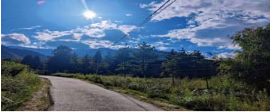
Figure 15: Low hanging cable of Sigma cable service near Zhiwa Ling Hotel, Satsam Chorten, Paro