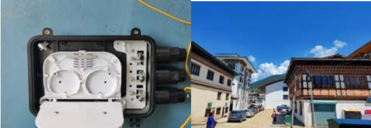
Figure 21 : FTTH splitters installed at indoor(right) and outdoor(left) locations.

The FTTH splitters are installed at multiple locations of the town for the distribution of fiber lines to the individual customers end. The FTTH splitters of BTL at Khuruthang town are installed at indoor buildings and as well as at outdoor aerial poles as shown in figure given below;