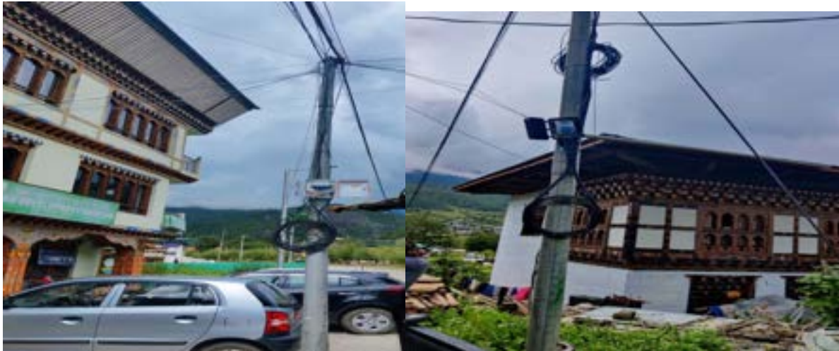
Figure 2 : FTTH splitters at various locations at Haa Town for fiber network distribution.

The FTTH network splitters are used for splitting and distribution of fiber network at customer end as shown in figure below;