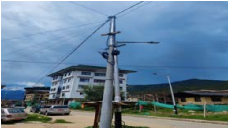
Figure 11: FTTH splitter installed at multiple location at Paro town

The FTTH splitter is installed at multiple locations of Paro town to distribute the internet leased line service to customers via fiber to home network.