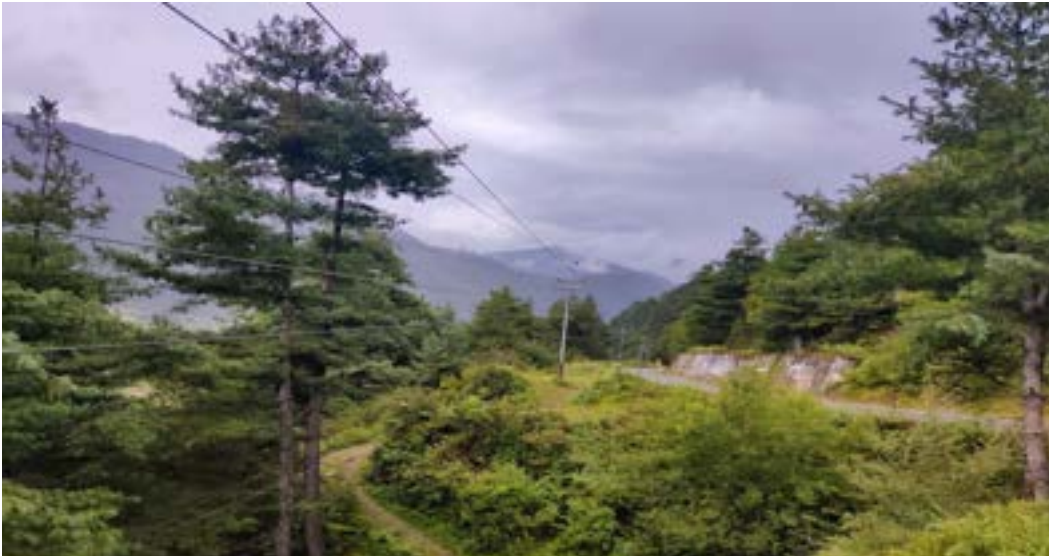
Figure 8: Low hanging cable of Leki near road point diversion towards chungdu school