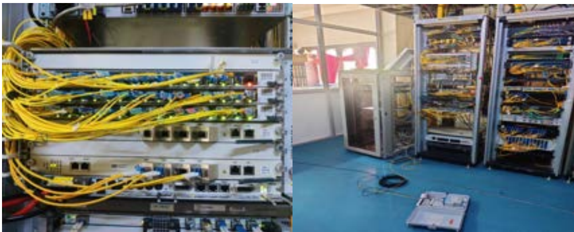
Figure 10: FTTH(GPON) equipment installed at Paro BTL Office

Only BTL has FTTH network implemented in Paro town, TICL does not have FTTH network at Paro town and they use radio network for internet leased line services. There are 3 FTTH(GPON) equipment in Paro BTL office of Nokia brand with each equipment cabinet having 16 ports each. Out of a total 48 ports, 47 ports have been utilized. Each port has the capacity to distribute 64 fiber to Home customers. The FTTH network of BTL in Paro is used in distribution of internet leased lines to its customers.