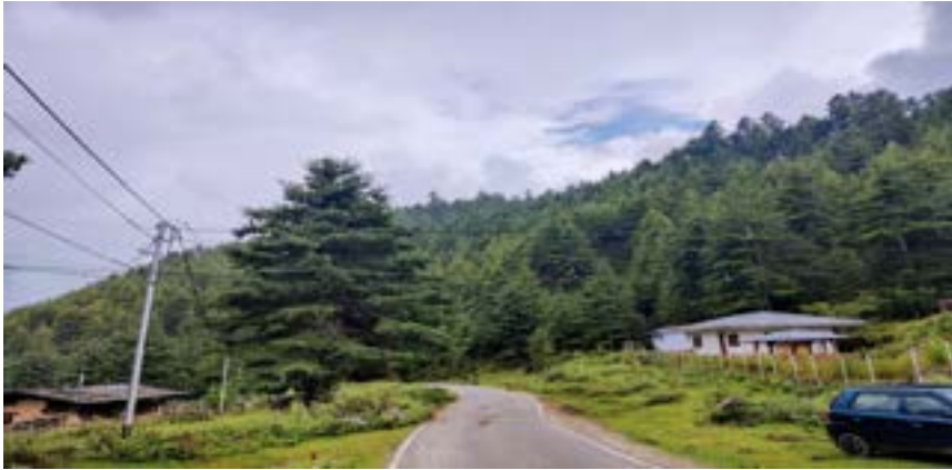
Figure 9 : Low cable road cross over of BTL cable near Bji Gewog Office, Haa