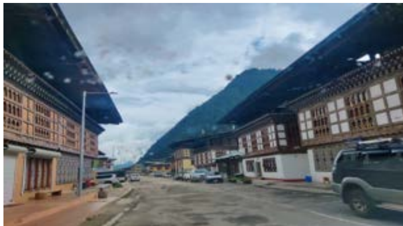
Figure 6: multiple cable road crossover with non usage of common poles for cable road cross over